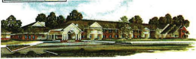
GRAND LEDGE'S FINEST RETIREMENT LIVING COMMUNITY

4775 Village Drive Grand Ledge, MI 48837 (888) 826-7116 www.seniorvillages.com