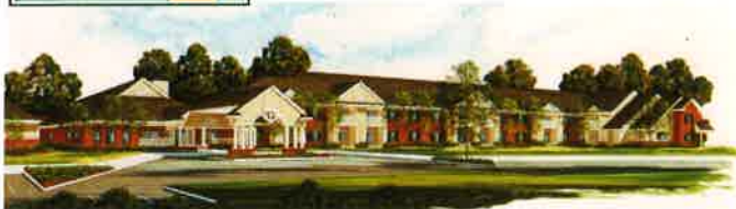
GRAND LEDGE'S FINEST RETIREMENT LIVING COMMUNITY

4775 Village Drive Grand Ledge, MI 48837 (888) 826-7116 www.seniorvillages.com