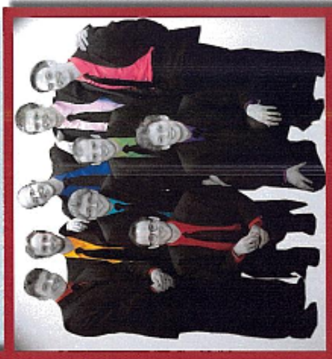
A capella Ensemble