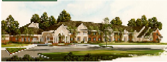
GRAND LEDGE IS FINEST RETIREMENT LIVING COMMUNITY

Retirement Living at its FINEST 1275 North Trill Grand Ledge, MI 48837 627-5500 ext. 115 www.independence.com