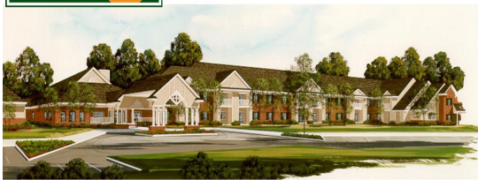
GRAND LEDGE'S FINEST RETIREMENT LIVING COMMUNITY

4775 Village Drive Grand Ledge, MI 48837 (888) 826-7116 www.seniorvillages.com