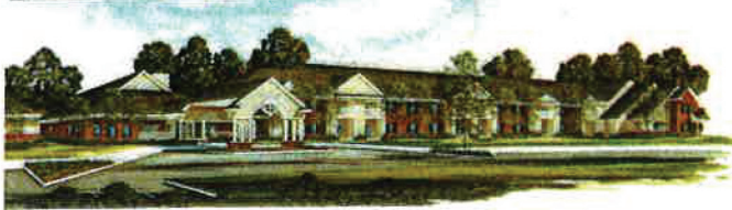
GRAND LEDGE'S FINEST RETIREMENT LIVING COMMUNITY

4775 Village Drive Grand Ledge, MI 48837 (888) 826-7116 www.seniorvillages.com