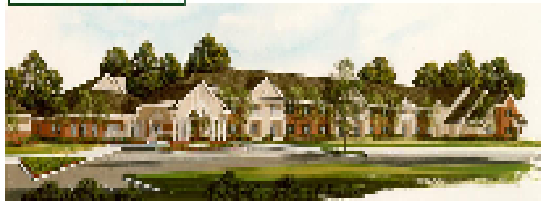
GRAND LEDGE'S FINEST RETIREMENT LIVING COMMUNITY

Retirement Living at its FINEST 1271 North Tru Grand Ledge, MI 48837 627-5300 www.independence.com